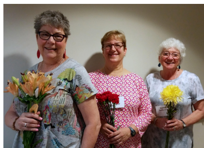
Outgoing LMPWC officers from left to right: